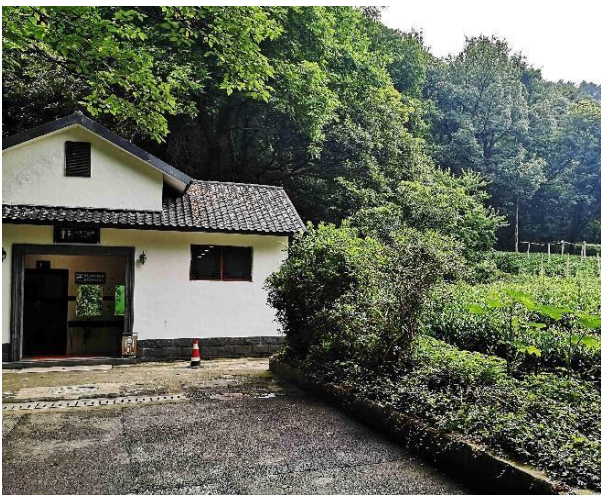
Figure 2 Public tourist restrooms in tea fields