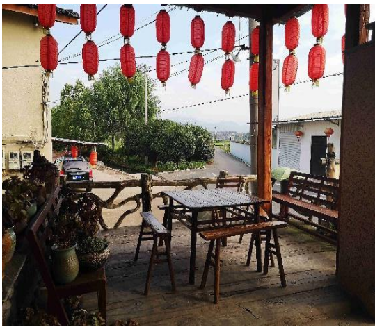
Figure 4. Rural tea house